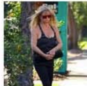
Goldie Hawn's Thanksgiving Attire