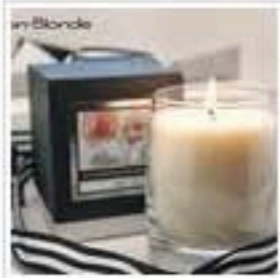
Gwendolyn-Mary Candles & Scents