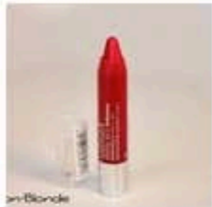
Clinique Mightiest Maraschino Chubby Stick Intense Moisturizing Lip Colour Balm