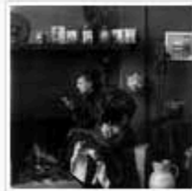
Malin+Goetz Tobacco Candle