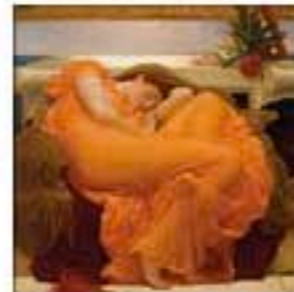
Five Perfumes I wear To Bed