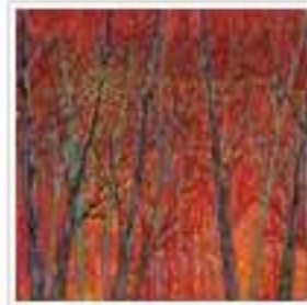
Thymes- Bitter Orange & Cedar Candle