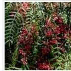
Molton Brown- Paradisiac Pink Pepperpod Single Wick Candle