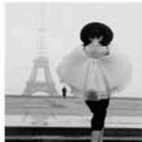
12 Modern Perfumes With A Classic Feel