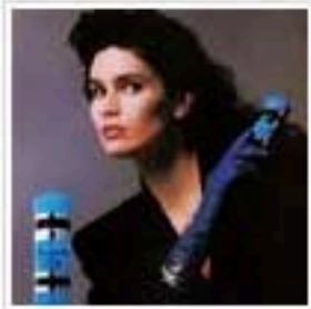
YSL- Rive Gauche (Vintage Perfume)